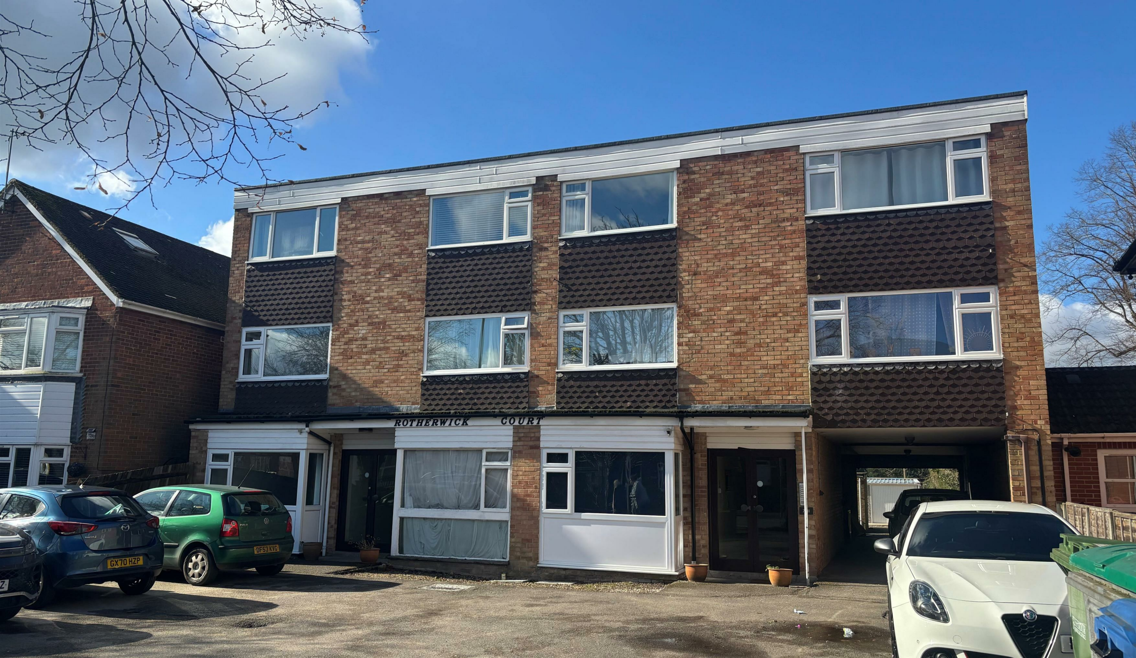
3 Rotherwick Court Alexandra Road, Farnborough